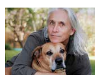
MFA is the real deal. They are a group of people dedicated to helping animals by exposing farm animal cruelty. It is a small, effective group, producing very good results for the money given to them. I totally support what they do.