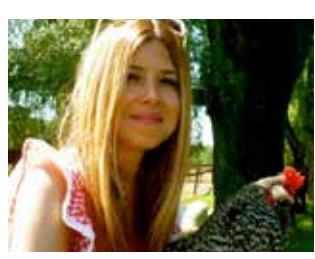
Mercy For Animals are relentless crusaders in the fight for animal liberation. They will go down in the history books for changing the way people perceive animals, particularly animals raised for food. They are true freedom fighters.

It is my belief that, on a dollar-for-dollar basis, MFA does more to reduce suffering than any group out there by focusing exclusively on "food animals," then utilizing considerable volunteer labor and marshaling media attention to their investigations. As longtime donors, it is our honor to continue our support of their efforts. They bring meaning to our money.